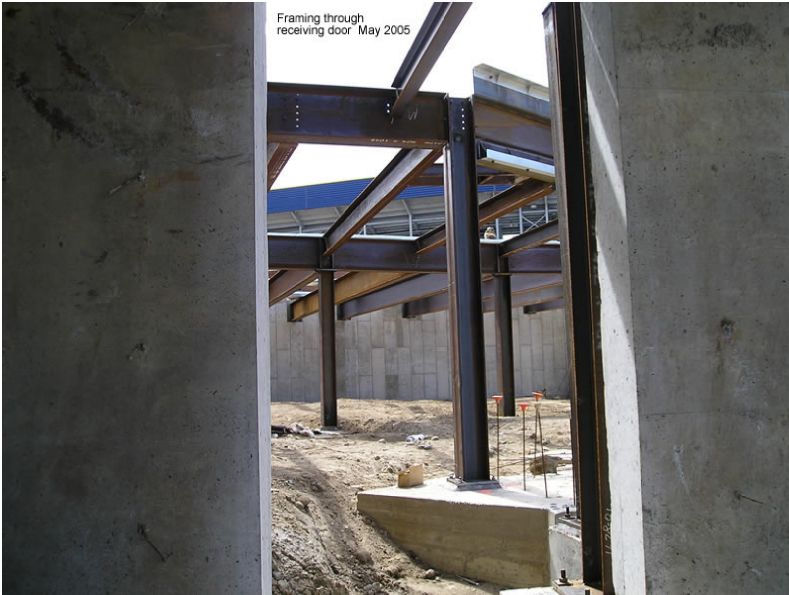
Framing through receiving door May 2005