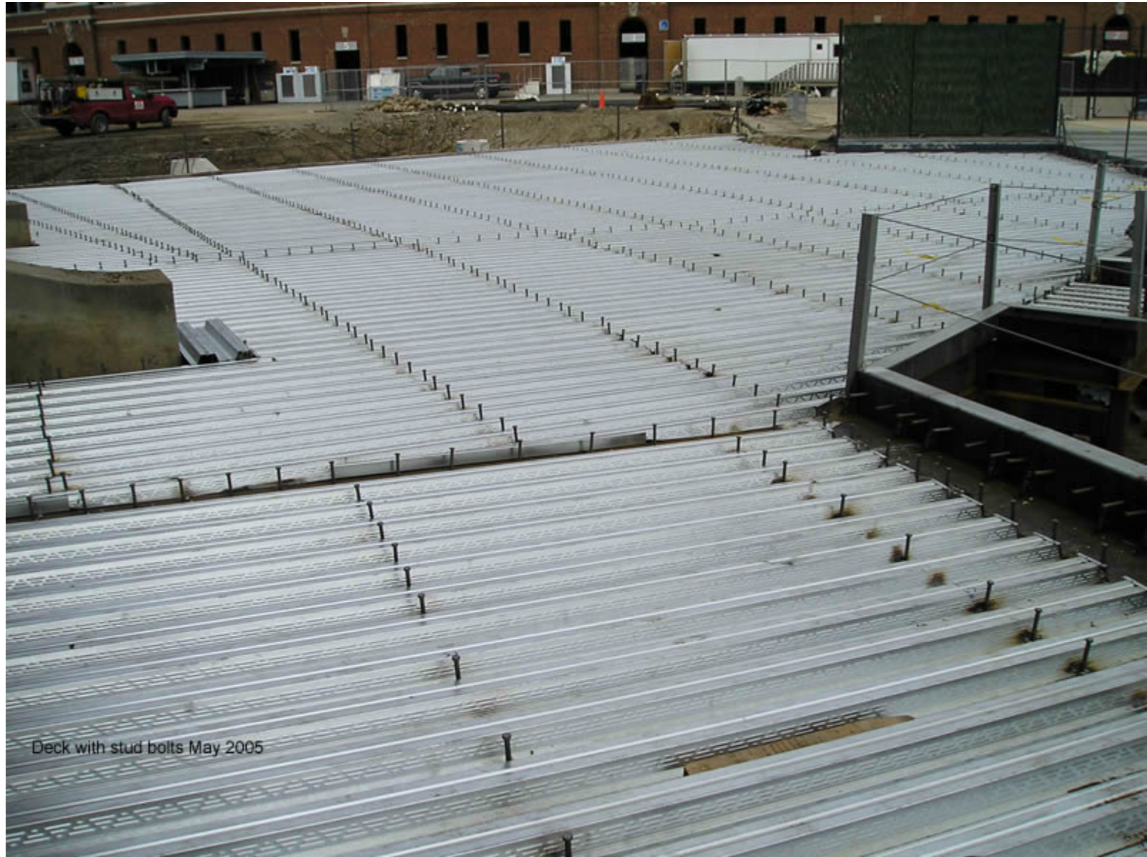
Deck with stud bolts May 2005