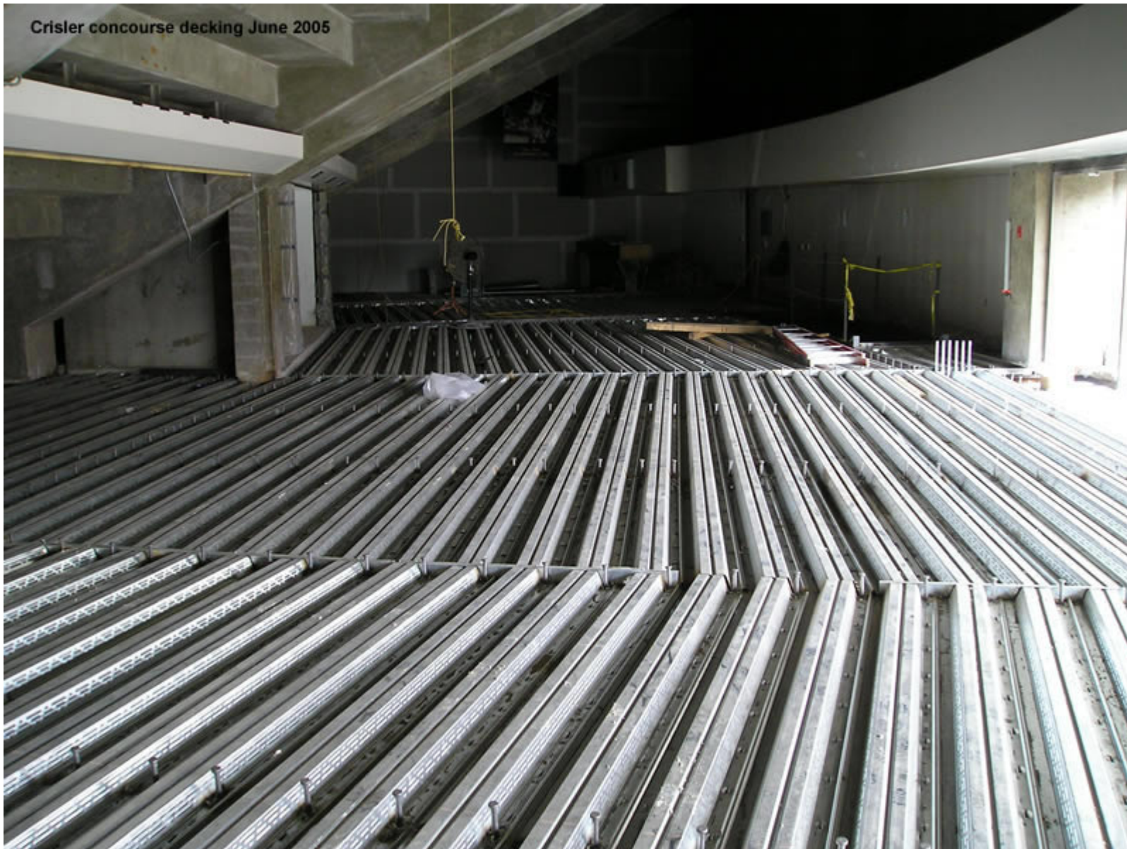
Crisler concourse decking June 2005